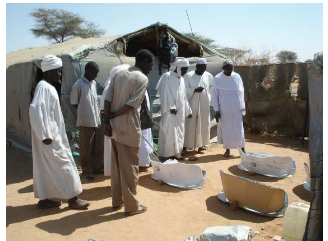
The young men ate the food !!