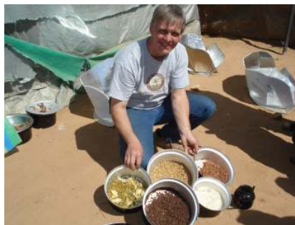
The food cooked great!!