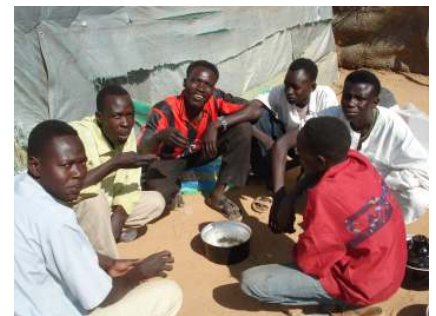
The tea was also a success !!

The Kassab IDP camp was tucked away in the northern part of Darfur near the town of Kutum. It has a well established infrastructure for food and water supplies. There are also other strong cohesiveness elements that make this a very good place for solar cooking. We met with about 60 camp elders to explain the plan to introduce solar cooking to the women. The elders gave us their blessing and later in the day wandered into our training area. After eating the meat we cooked with the sun we knew we had passed the test. As we drove out of the camp in the afternoon we saw one of our lady students demonstrating to a group of men the way the solar cooker works.